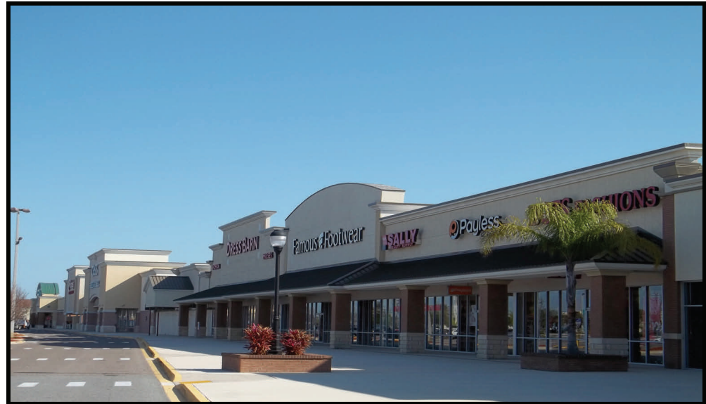
660 Commerce Center Drive, Jacksonville, FL 32225