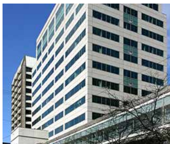
1101 Madison Tower 1101 Madison Street, Seattle