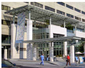
Arnold Medical Pavilion 1221 Madison Street, Seattle