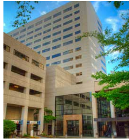
Elmer J. Nordstrom Medical Tower 1229 Madison Street, Seattle