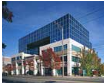
600 Broadway 600 Broadway, Seattle