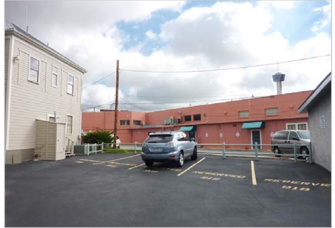
Back of Building and Parking Area