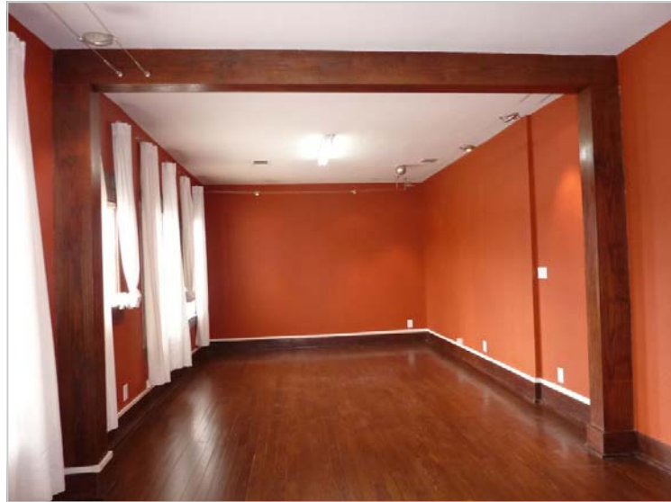
Second Floor Office/Conference Room/ Work Area