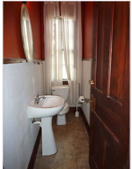
First Floor Bathroom