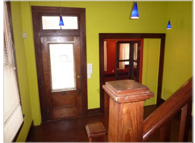
Front Entrance Area and Stairs to Second Floor