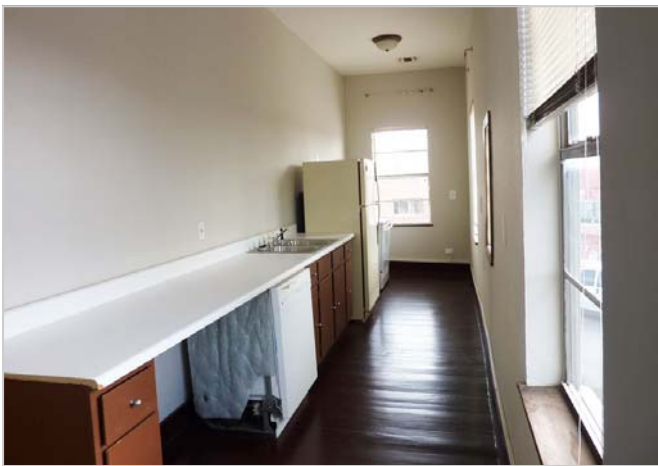
Second Floor Kitchen Area