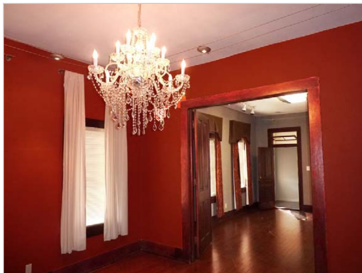
View from Large Front Office to Large Office or Work Area