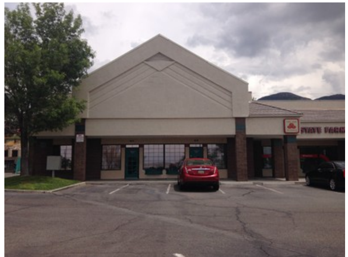
A1 + A2