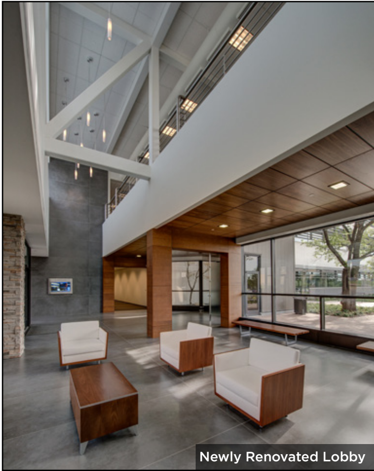
Newly Renovated Lobby

3300 RENNER ROAD RICHARDSON, TX 75082 | WWW.3300RENNER.COM