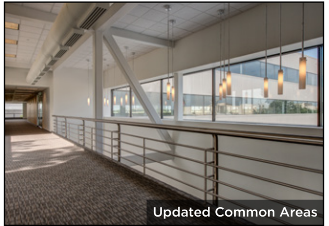
Updated Common Areas